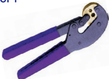
Crimp tool for FCN 11 F Connector Price £29.90