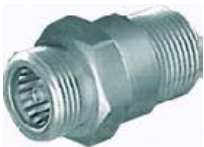
0-2300MHz 10A IEC,